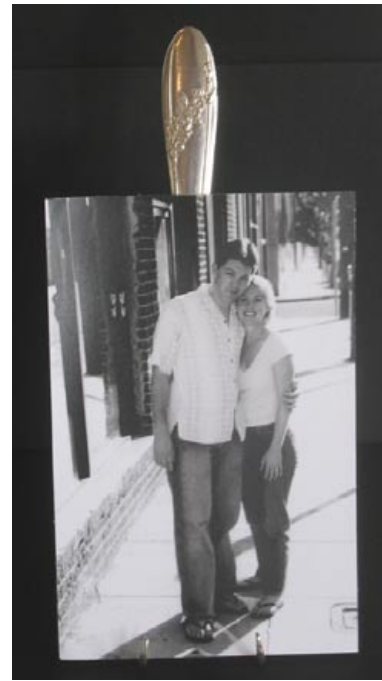
Use needle nose pliers to bend the tines of a family heirloom fork to create an unusual photo stand