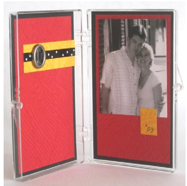
Recycle a plastic “crystals” box into a miniature photo frame