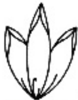
Japanese Ribbon Stitch